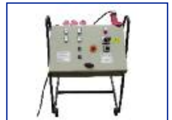
Control box for 4 column system