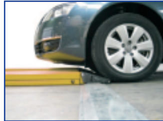
Easy to drive-over even with low cars

Car service bays Bodyshops in conjunction with Jig and panel repairs Brake repairs and service Suspension replacement Transmission repair and replacement General repair bay