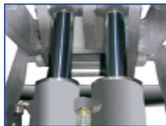
Double hydraulic system Double volumetric cylinder under each platform